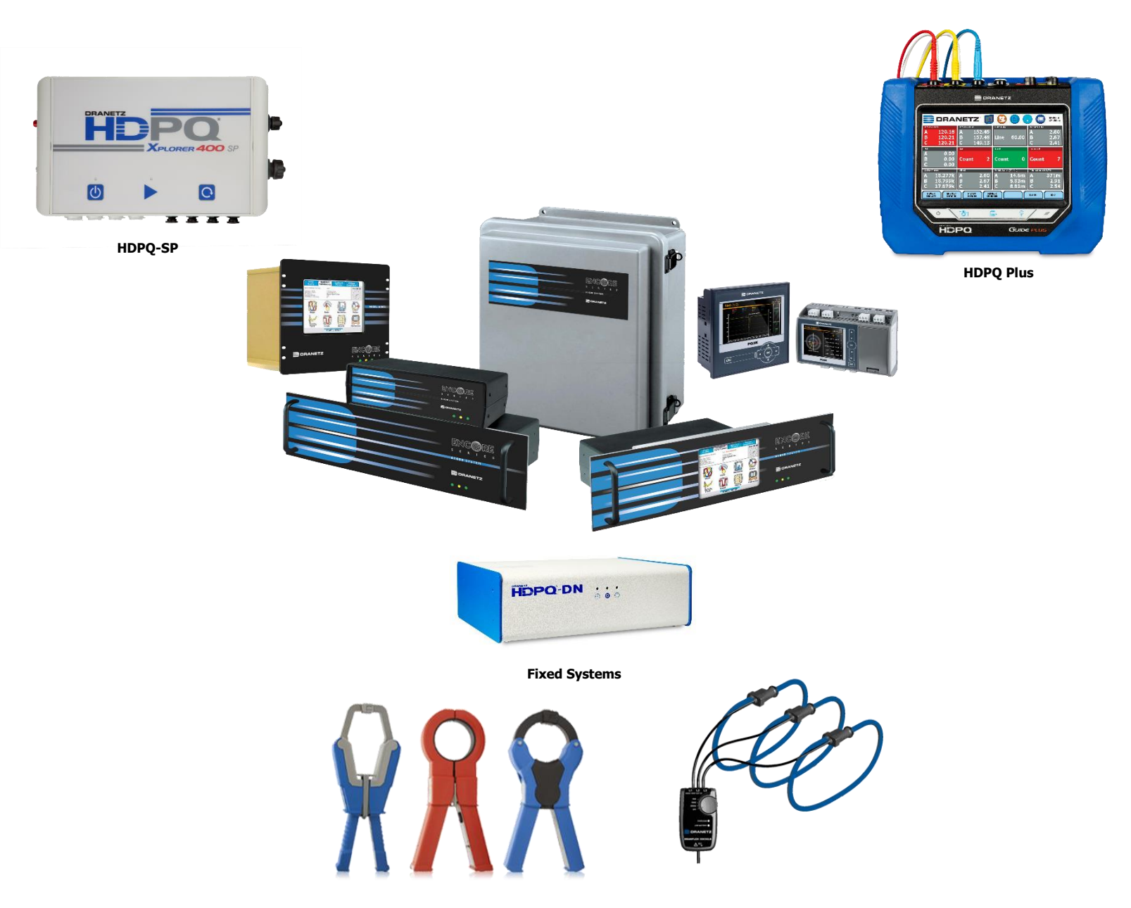
Dranetz Measurement Accessories