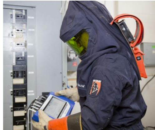
Figure 1. Portable power quality monitor being installed by an electrician wearing PPE clothing

Portable PQ monitors, such as the Dranetz HDPQ family are typically used in temporary applications, and are installed for the duration of the survey and removed upon completion. Such monitors usually have safety (banana jack) connections for voltage and clamp-on or Rogowski coil (Flex) CT's for current measurements. Survey results can be reviewed on the instrument's local screen (if available) and/or uploaded to application software such as Dran-View 7 from Dranetz.