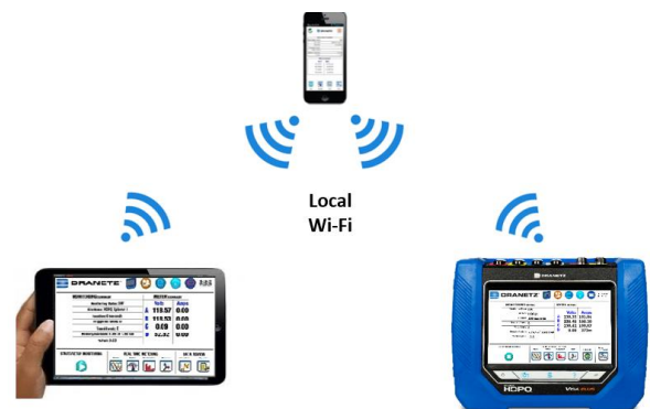
Figure 2. Dranetz HDPQ remote communications with a Tablet & Smartphone.

The latest generation of portable monitors such as the Dranetz HDPQ enhance user safety and productivity by using Wi-Fi, Ethernet and Bluetooth communications to fully remote control the instrument after the physical installation. Users can close the cabinet door and use their Tablet, Smartphone or Computer to set up monitoring and review and download data remotely, greatly reducing their exposure to hazardous environments.