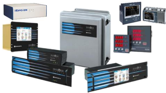
Figure 3. Dranetz permanently installed instruments.

closed doors of cabinets or switchgear, and remotely monitored by server software using an Ethernet or fiber network. Oftentimes, multiple permanent PQ monitors are installed at key points within a facility creating a monitoring system, such as at the PCC, UPS's, generators and at critical loads. Recorded trend and PQ event data is automatically transferred to the server software for use by facility personnel to proactively monitor the quality of supply or to reactively resolve PQ problems as they occur.